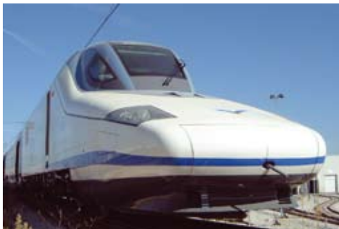
The high speed train AVE S102 for the Spanish line Madrid-Barcelona is built and will be approved according to the technical specification for interoperability (TSI). PROSE supports the project team in the tasks related to the approval of the train set.

Nowadays, the vehicle supplier is responsible to reach an approval for his vehicle. Evidence of properties has to be given to authorities and bodies by documents and by executing tests. Notified bodies for Interoperability are responsible for interoperability constituents, network operators check the fulfilment of safety requirements, requirements concerning compatibility with the infrastructure as well as some important key properties. Last but not least, the vehicle operator requires an evidence on the contractually agreed properties. The approval processes of those authorities and bodies are normally not coordinated. The management of the approval process shall ensure an approval within budget and time frame as previously agreed.