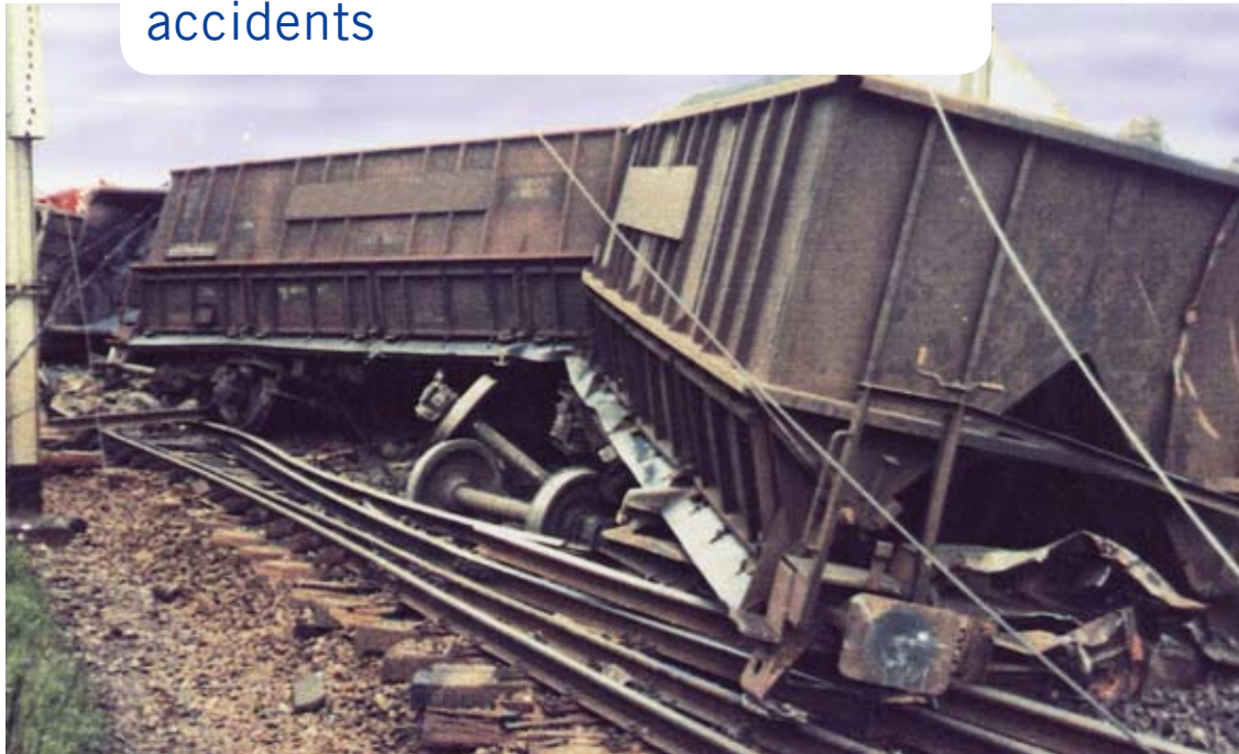
Accident with an ore transport train after a journal failure