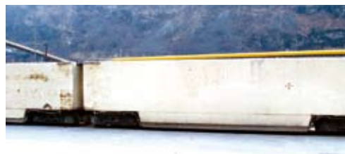
Working accident with a material transport train in the tunnel working site

PROSE disposes of experts with considerable experience in the railway industry and with the necessary theoretical background to approach the tasks efficiently and based on a clear structure. PROSE expert opinions are technically sound and based on the state of the art. Since PROSE is an independent engineering company, the necessary neutrality in the assessment of operating disturbances and accidents is granted.